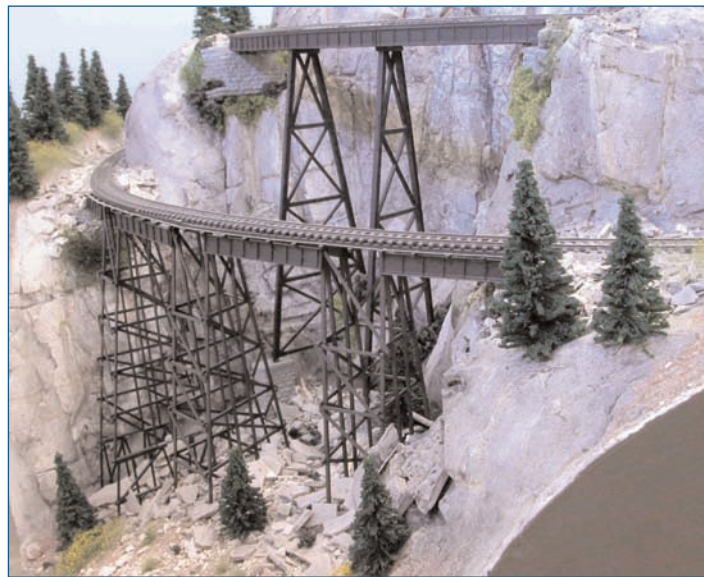
A section of a complete fully scened layout, including two scratch-built trestles.