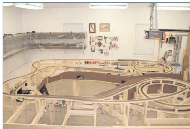
A mechanically complete layout, ready for owner-installed scenery and structures.